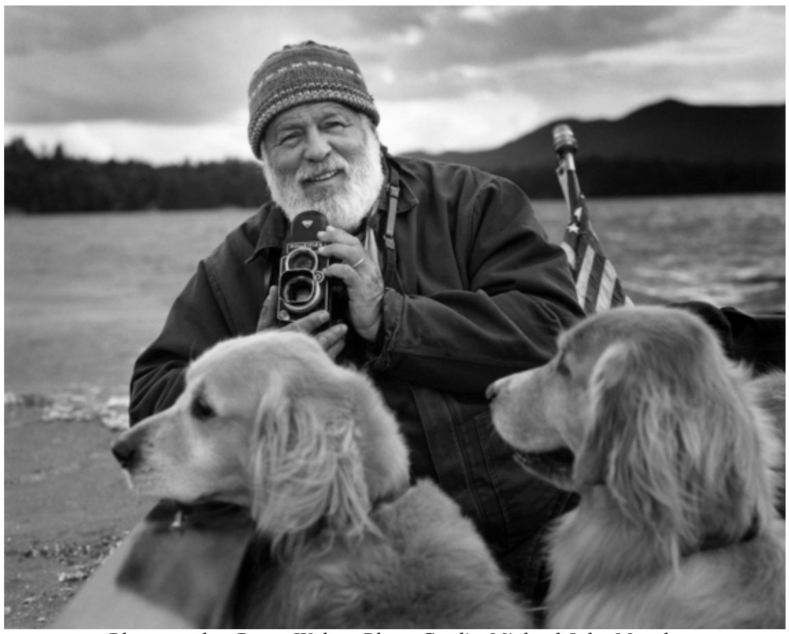
Photographer Bruce Weber

"The city was so welcoming--even though it's a big place and spread out, Detroit had that wonderful small-town kind of attitude," Weber <u>told Shinola.</u> "People were really friendly, they looked you in the eye when they said hello on the street, and they greeted you with a smile."